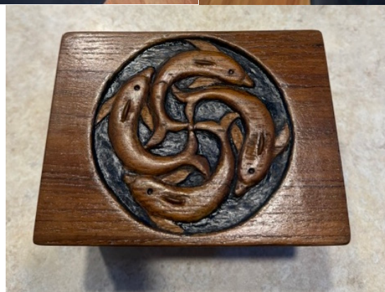
Carved in teak and yellow cedar